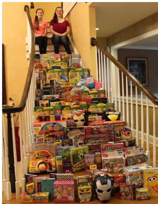
Just a few of the many boxes and boxes of art & craft supplies, games, and other supplies the Sherman 8 th Grade students worked hard to get for the Children in Boston